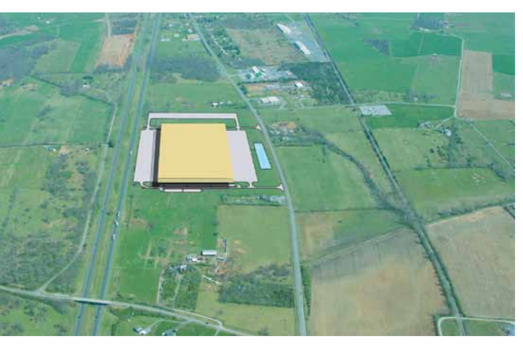
Future McKesson Distribution Center, Winchester, VA