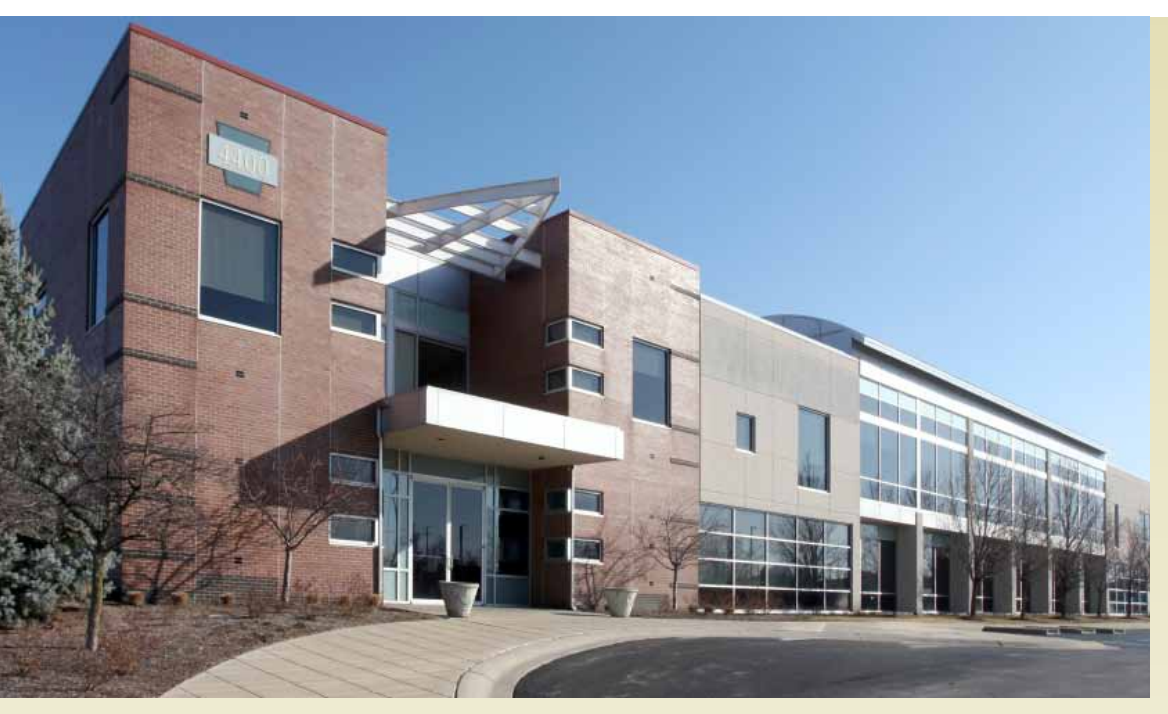
4400 West 96th Street, Carmel, IN

n August 2012, an affiliate of BPG acquired 4400 West 96th Street, 97,323 square foot, Class A office/warehouse building located in Carmel, Indiana, for $3,750,000 from a joint venture managed by a publicly traded REIT. The acquisition was made on behalf of BPG Investment Partnership IX, L.P., its newly formed value-add real estate fund.