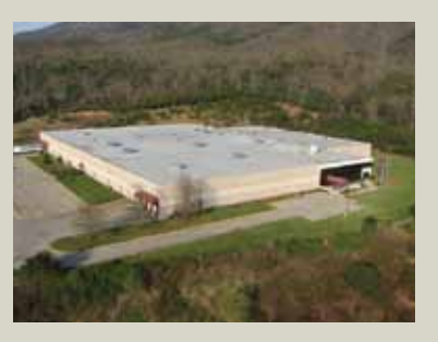
3200 GREEN FOREST

Goodlettsville, TN Multifamily 200 Units $8,625,000