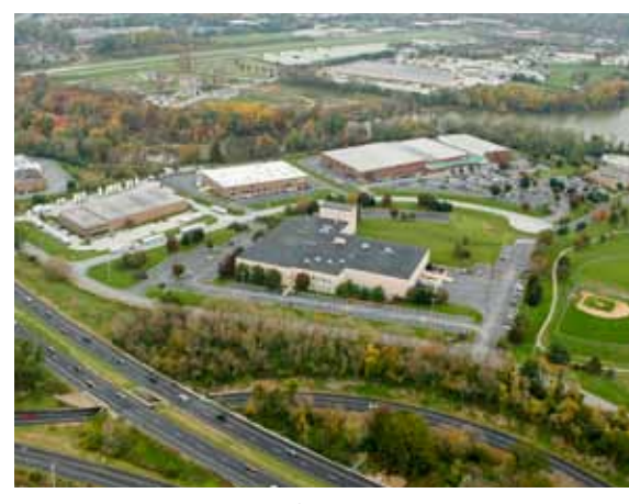
200 Lawrence Drive, West Chester, PA

(Continued from page 1) company designs, develops, and distributes insulin pumps. 200 Lawrence Drive offers easy access to Route 202, Route, 3, The Brandywine Airport, and is in close proximity to many biotechnology companies located along the 202 Corridor in Chester County.