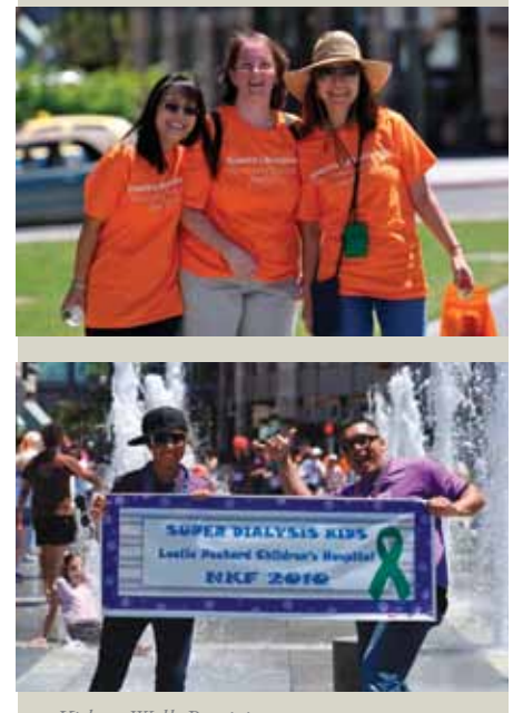
Kidney Walk Participants

One in nine Americans has chronic kidney disease and many others are at risk. These walk events present an occasion for dialysis patients, organ transplant recipients, donor families, living donors, medical communities and the general public to support the National Kidney Foundation's mission. For more information on the Foundation, please visit www.kidney.org.