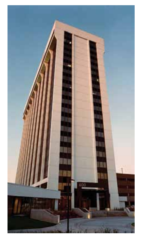
Metropoint 600, St. Louis Park, (Minneapolis) MN