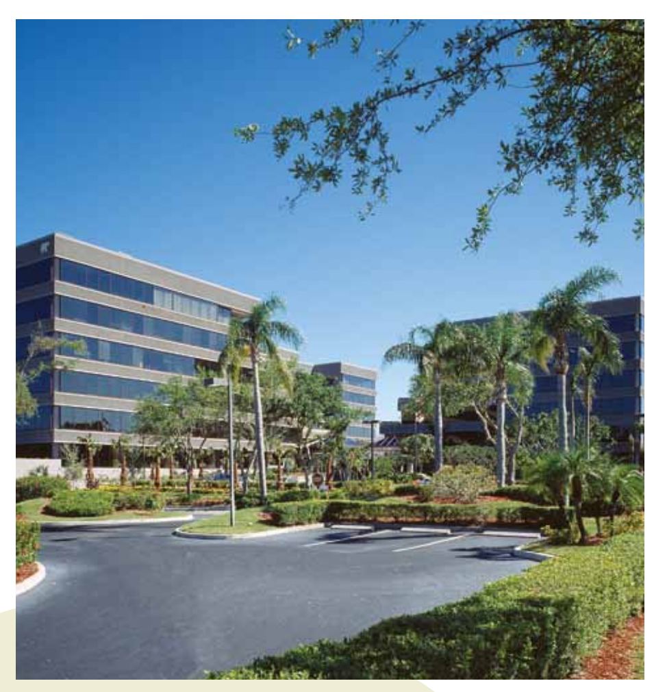
Golden Bear Plaza, Palm Beach Gardens, FL