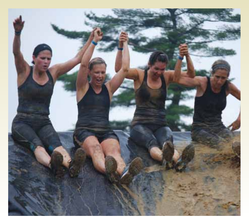
Mud Run Participants

The second annual run raised more than $825,000 for the National MS Society, a collective of passionate individuals who want to move together toward a world free of multiple sclerosis. The society's mission is to mobilize people and resources to drive research for a cure and to address the challenges of everyone affected by MS. Presently, there are more than 400,000 Americans living with MS. For more information on the Society, please visit www. nationalmssociety.org