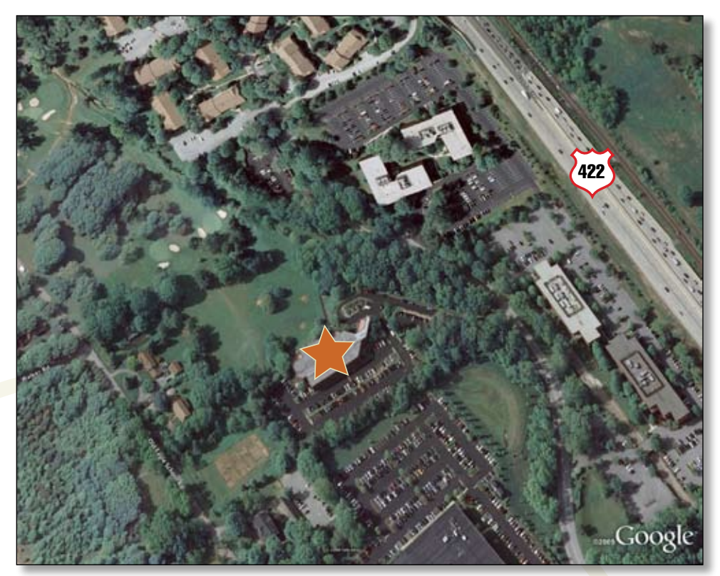
1250 Drummers Lane, Wayne, PA

minutes from Route 202, in Wayne, Tredyffrin Township, Pennsylvania. It offers a private campus setting, overlooking the golf course at Glenhardie Country Club. The building has an on-site data center, café and a 500 KVA generator for full building electrical backup. The property is approved for a contiguous building expansion of up to 50,000 square feet. The property is being marketed for sale or lease by John Perkins of Grubb & Ellis.